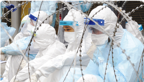
Thursday, November 5, 2020 Malaysia in final stages of COVAX negotiations