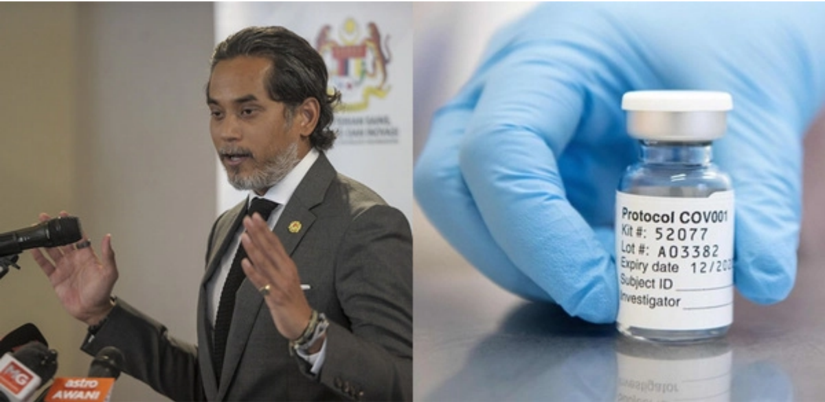
Here's How The COVID-19 Vaccines Will Be Distributed In Malaysia