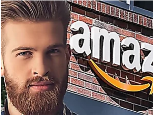
$250 Investment in Companies like Amazon Could Give you a Second Income! Sponsored | nextlanders.com