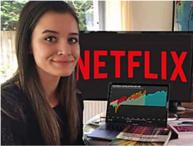
Invest now $ 250 in Companies like Netflix and get a monthly income. Here's how to do it... Sponsored | Smart Invest