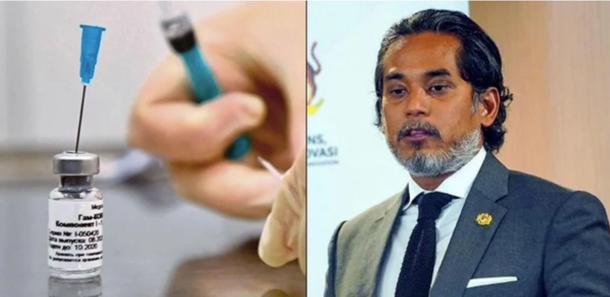
Khairy: COVID-19 Vaccine Won't Be Mandatory And Will Only Be Given To 18 Years And Above