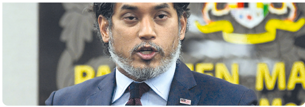
Wednesday, July 29, 2020 Duopharma, Pharmaniaga among frontrunners for Covid-19 fill-and-finish task