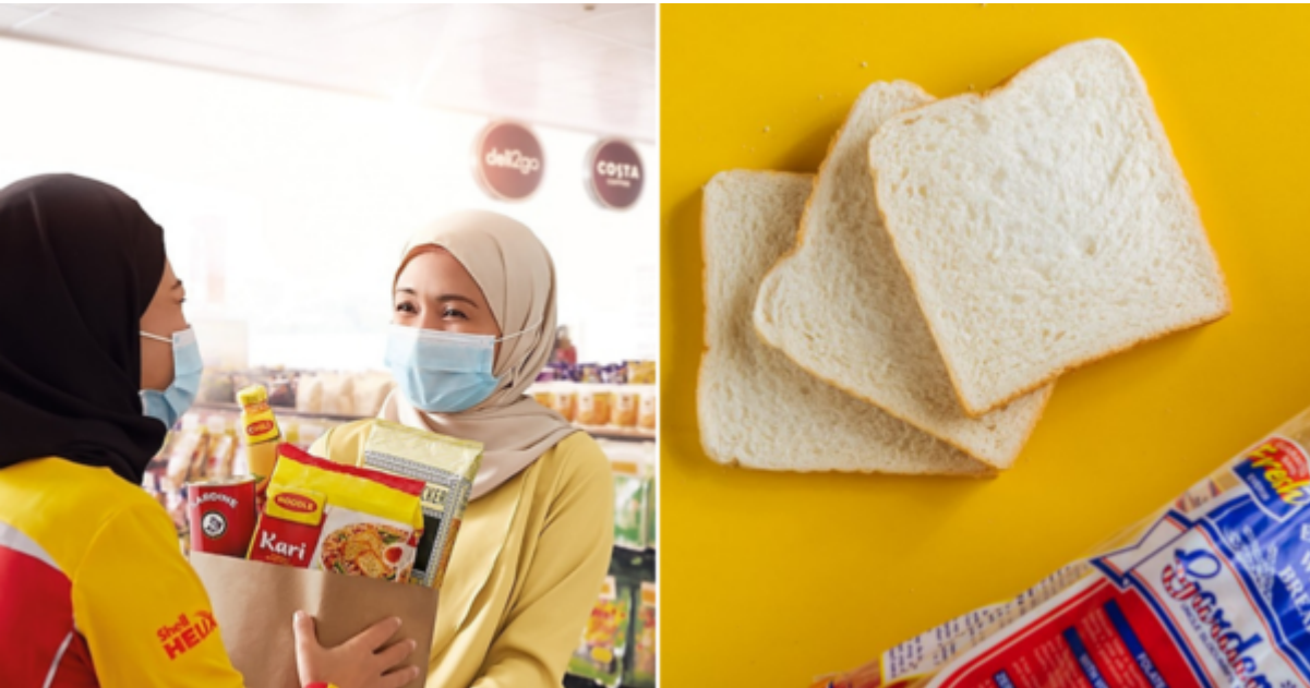
You Can Now Stock Up On Groceries While Pumping Petrol, And Enjoy Amazing Deals From RMI