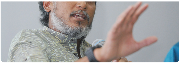
Thursday, September 24, 2020 Mosti tables application to build National Vaccine Centre