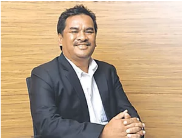
Nokia, Allo to deploy gigabit fibre network Themalaysianreserve.com