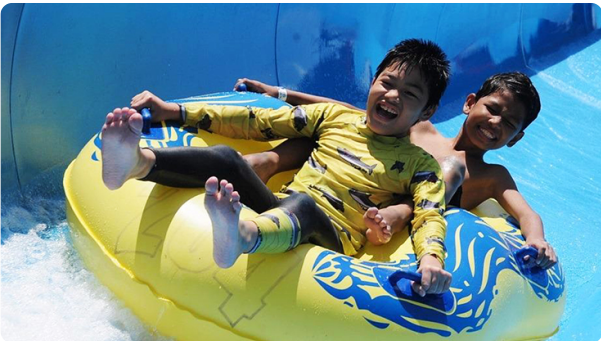
Monday, June 29, 2020 Theme parks to resume operations starting July 1 – Ismail Sabri