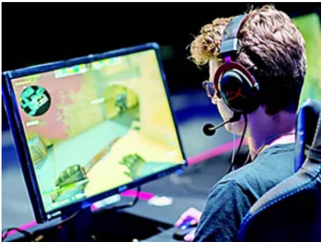
Malaysia needs to leverage growth of eSports Themalaysianreserve.com