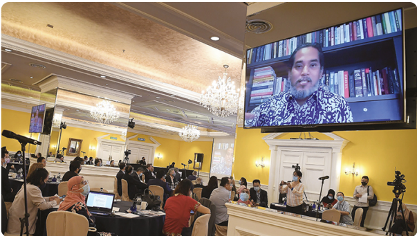
Wednesday, October 7, 2020 Malaysia needs to consider itself a start-up nation