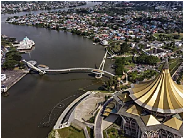
MCO in entire Sarawak from May 29