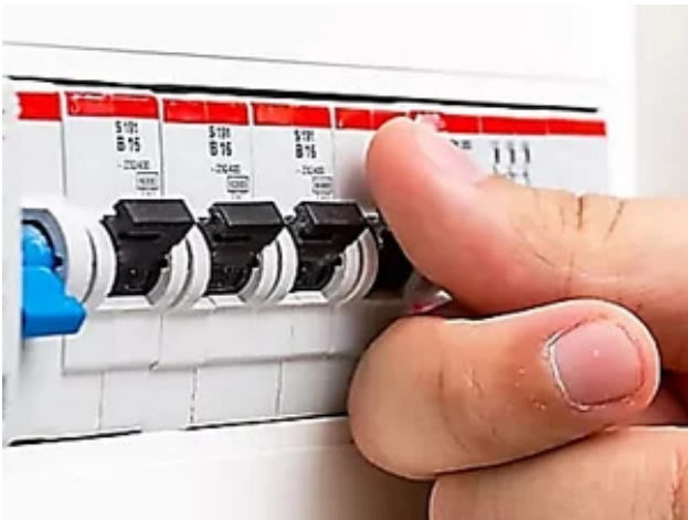
How to Reduce Your Electric Bill by Up to 90% Sponsored | Electricity Saver