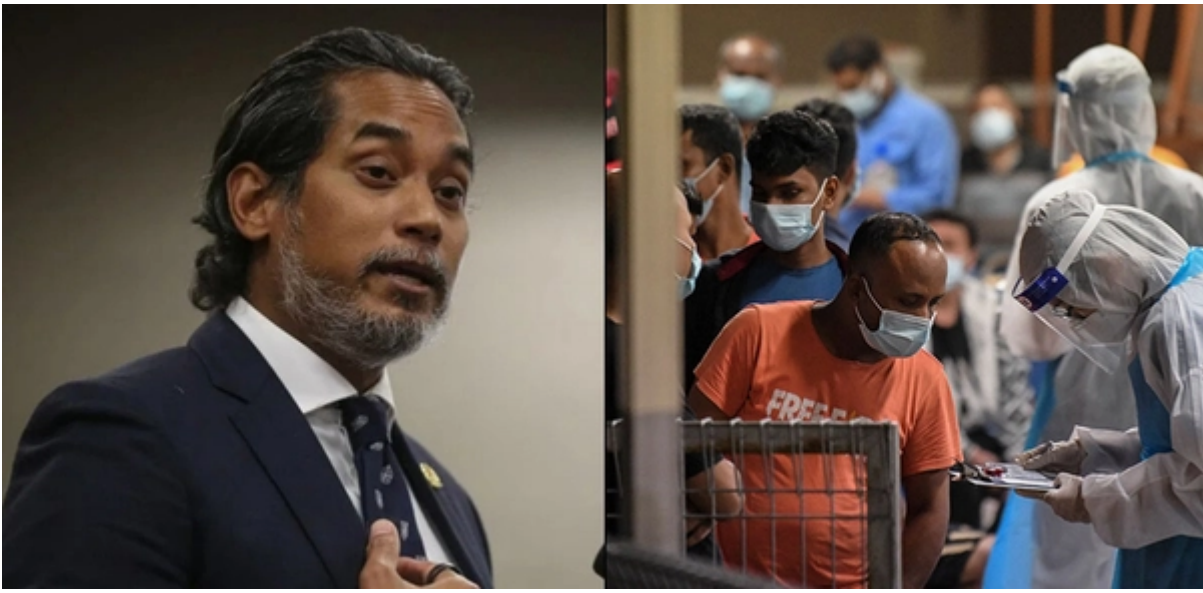
Khairy: All Foreigners Residing In Malaysia Will Get Free COVID-19 Vaccines