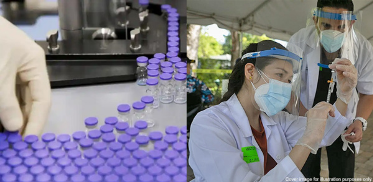
Are The COVID-19 Vaccines Safe? We Asked A Doctor To Explain How They Were Made So Fast